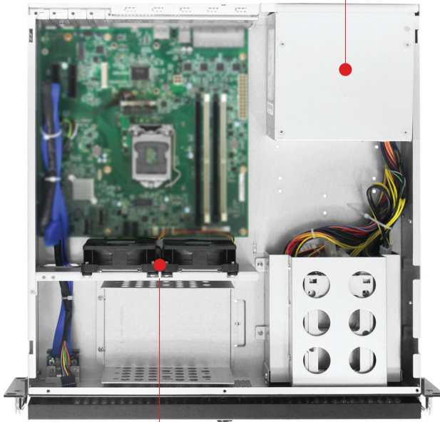
2 x 8025 (3P) cooling fans