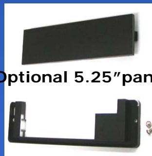
Optional 5.25" panel