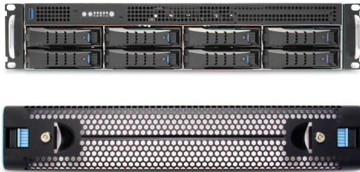
Optional item - Front door