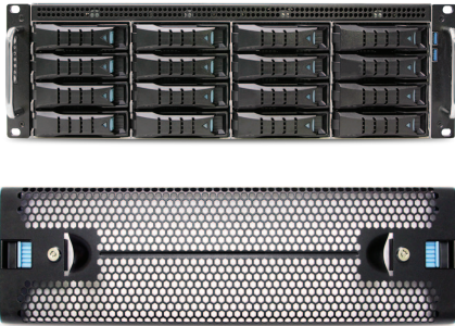
Optional item - Front door